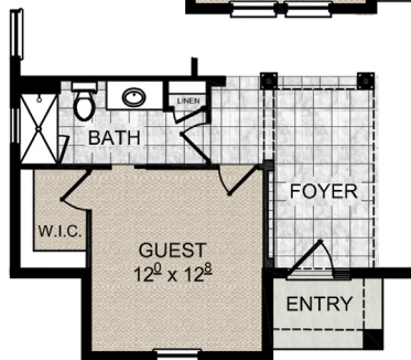
OPTIONAL GUEST SUITE 66 ADDITIONAL SQ. FT.